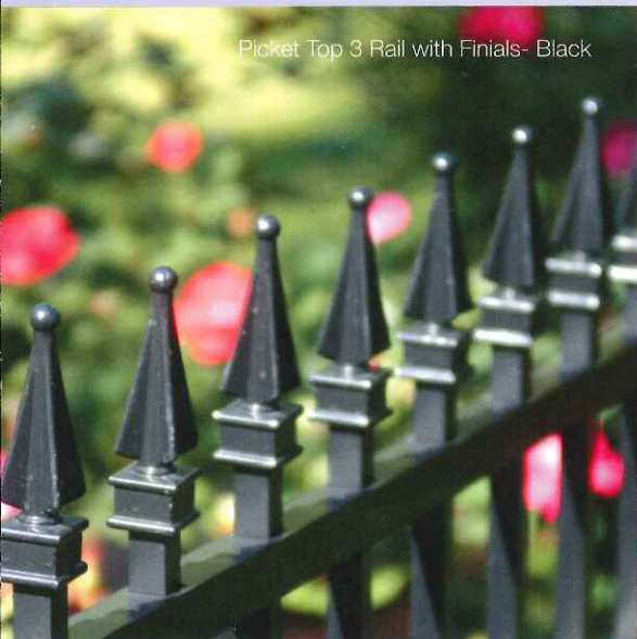
Picket Top 3 Rail with Finials - Black